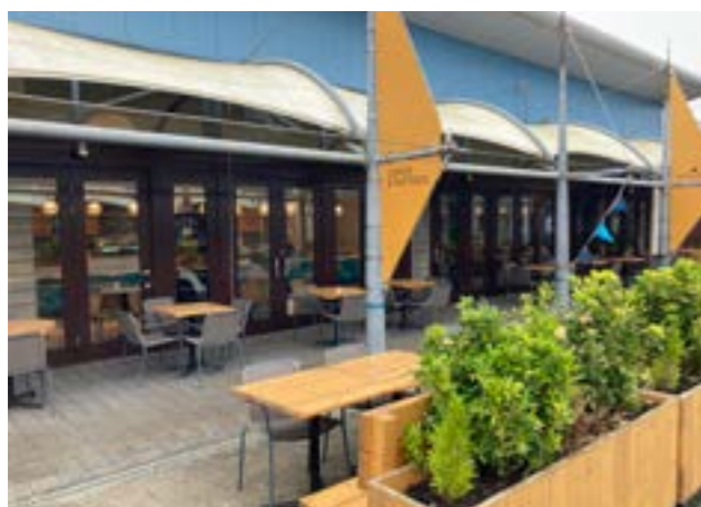
The Cornish Bakery

There are two eateries at Affinity Devon Outlet Shopping Centre - The Cornish Bakery and Costa. Both have indoor and outdoor seating.