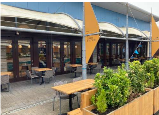
The Cornish Bakery

There are two eateries at Affinity Devon Outlet Shopping Centre - The Cornish Bakery and Costa. Both have indoor and outdoor seating.